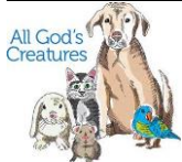
All God's Creatures

Bring your animals to St. Bernard Rectory on Sunday, October 2 nd at 12 noon to receive a blessing for your pets. It will be held on the lawn behind the church.