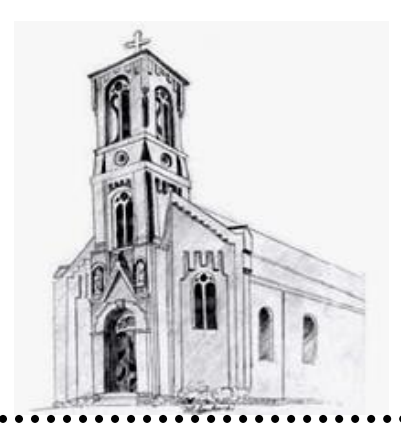
St. Damian Parish Founded 1861 One West Main Street Damiansville, Illinois 62215